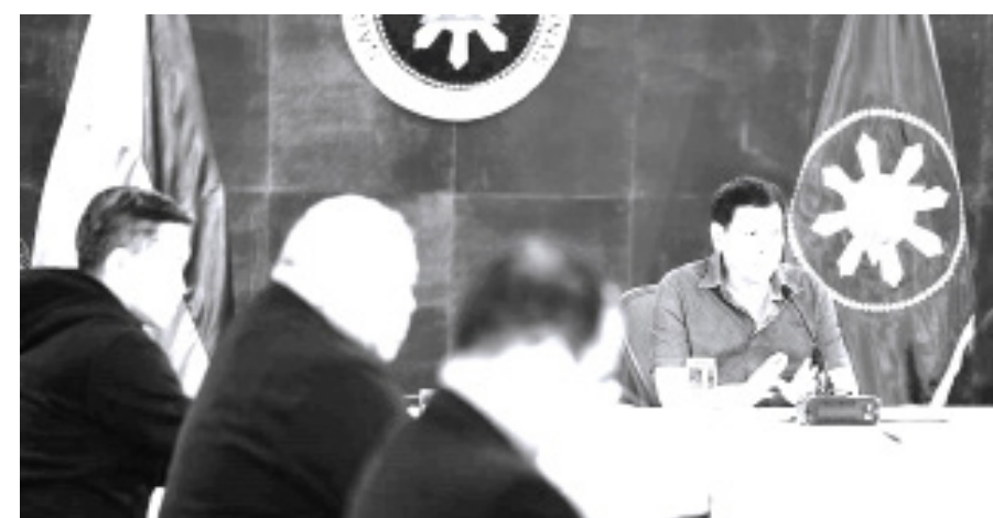
President Rodrigo Roa Duterte presides over a meeting with key government officials prior to his "Talk to the People" at the Arcadia Active Lifestyle Center in Matina, Davao City on May 11, 2022.

President Rodrigo Roa Duterte thanked the medical and scientific community, as well as frontliners for remarkably fighting COVID-19 alongside his administration.